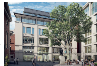
Artists' rendering of a revamped One Bow Churchyard