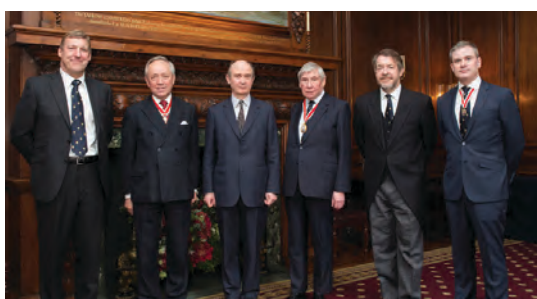
Office Bearers 2016-2017 and Guest Speaker, Norroy & Ulster King of Arms