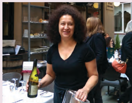
Krasl al fresco at the Bow Wine Vaults in Bow Churchyard.