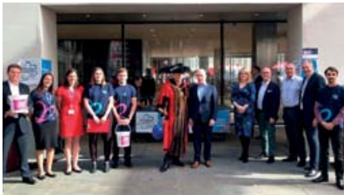
Lord Mayor and respective teams from Bol and ASI

Many businesses in the Ward played their part in the now annual City Giving Day, a day in the City calendar set aside to celebrate the value of the City to society. More than 300 City businesses across the City came