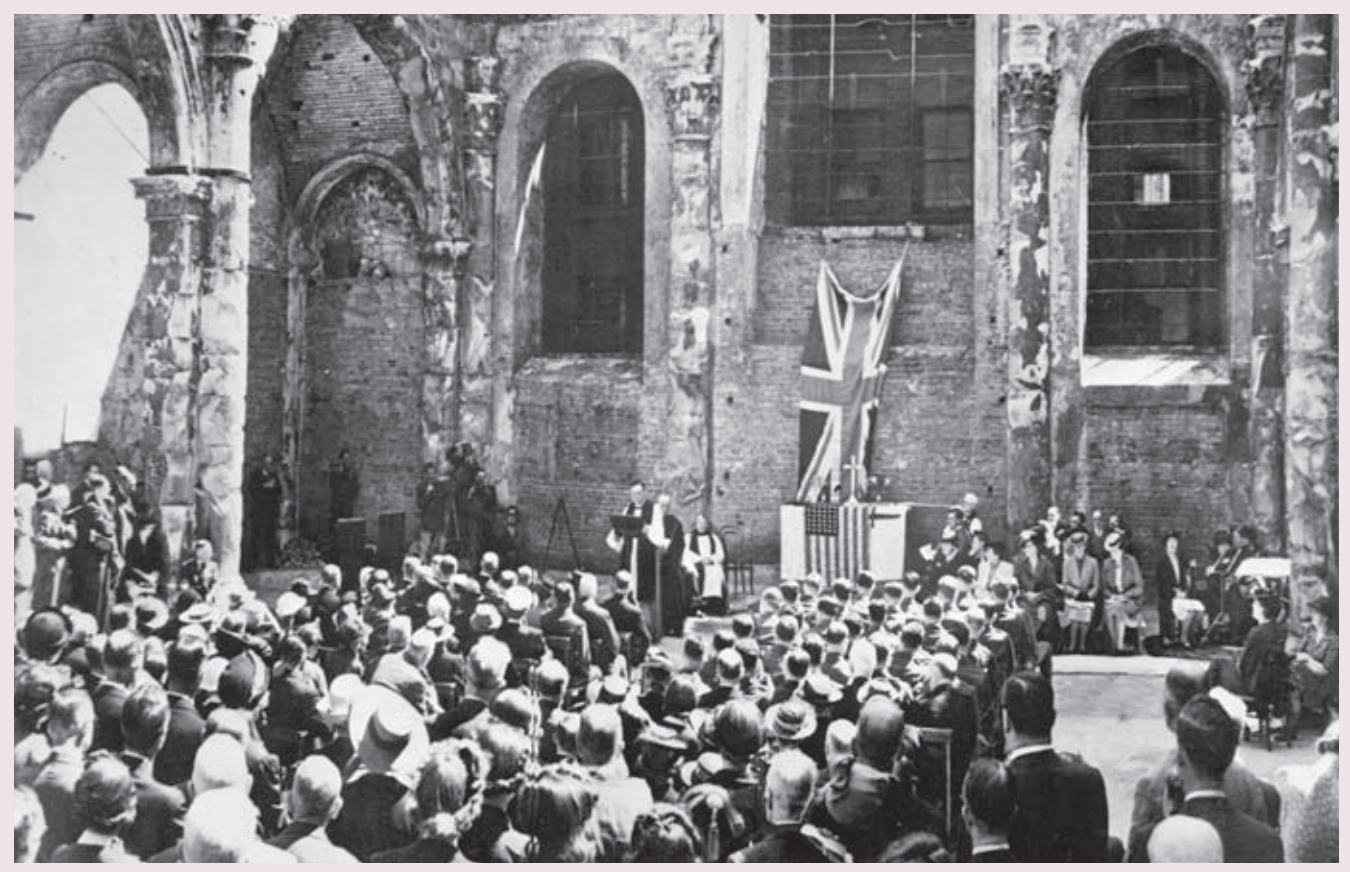
A service in the ruins of St Mary-le-Bow church

St Mary-le-Bow Church was almost destroyed on the night of 10-11 May 1941, arguably the worst night of the Blitz for the City. The four walls and the tower alone remained standing – although the latter had to be taken down and stored for many years as unsafe.